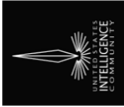
National Intelligence Estimate

Iran's "unlikely to produce a sufficient quantity of highly enriched uranium... before 'early to mid-next decade.'" (2005)