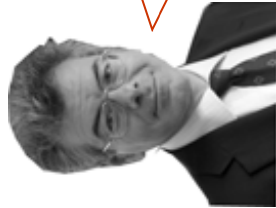
Gary Samore International Institute of Strategic Studies

"I think it's perhaps more likely that they try to develop their nuclear capabilities over a much longer period of time, a decade or 15 years." (2005)