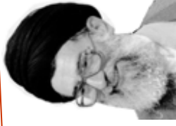
Ayatollah Ali Khamenei Head of State, Supreme Leader of the Islamic Revolution. Ultimately calls the shots and has direct control over the military and courts.