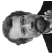
Ali Larijani Head of the Supreme National Security Council. Khamenei's right hand man when it comes to foreign policy.