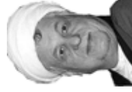
Expediency Council Majles and Council arbitrator (when the two bodies hit a road block). Headed by ex-president Rafsanjani, who seems to still be influential in foreign policy.

Newly created by Khamenei, some say to help deal with his Ahmadinejad problem.