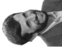
Ahmadinejad The prez. Technically has nothing to do with foreign relations, but has had an increasingly effective way of butting in. No one agrees on how much he's a fool suffered by Khamenei or if he's got power in his own right.