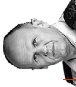
General Aharon Zeevi Farkash, Head of Israel Defense Forces